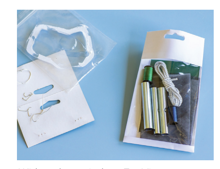
With a clear window, EcoView can reduce the number of packaging components.

EcoView offers three different sizes of windows: sneak peek, partial view and full display. Each size offers customers a clear, protected product view, while also providing additional space for branding and messaging.