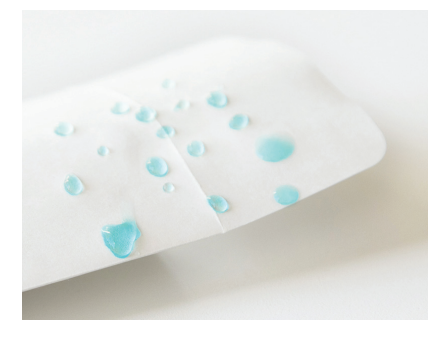
Hydroblox repels water, creating a protective barrier in moisture-rich environments.

Announced on America Recycles Day in November 2023, Hydroblox is a water-resistant, uncoated, recyclable packaging paper. Engineered to offer superior barrier protection for products with potential exposure to water or condensation, Hydroblox has 200 percent greater water resistance than a standard 24-pound white wove paper. Certified recyclable by Western Michigan University, Hydroblox is a proprietary packaging paper with FDA approval for use with food products, such as chocolate and baked goods. In addition to perishable items, it can be used for various applications where water-resistant properties are needed, including outdoor gear and camping equipment, personal care items, documents, cosmetics, art supplies and pet products.