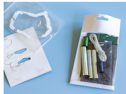
With a clear window, EcoView can reduce the number of packaging components.

EcoView offers three different sizes of windows: sneak peek, partial view and full display. Each size offers customers a clear, protected product view, while also providing additional space for branding and messaging.