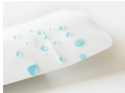
Hydroblox repels water, creating a protective barrier in moisture-rich environments.

Announced on America Recycles Day in November 2023, Hydroblox is a water-resistant, uncoated, recyclable packaging paper. Engineered to offer superior barrier protection for products with potential exposure to water or condensation, Hydroblox has 200 percent greater water resistance than a standard 24-pound white wove paper. Certified recyclable by Western Michigan University, Hydroblox is a proprietary packaging paper with FDA approval for use with food products, such as chocolate and baked goods. In addition to perishable items, it can be used for various applications where water-resistant properties are needed, including outdoor gear and camping equipment, personal care items, documents, cosmetics, art supplies and pet products.